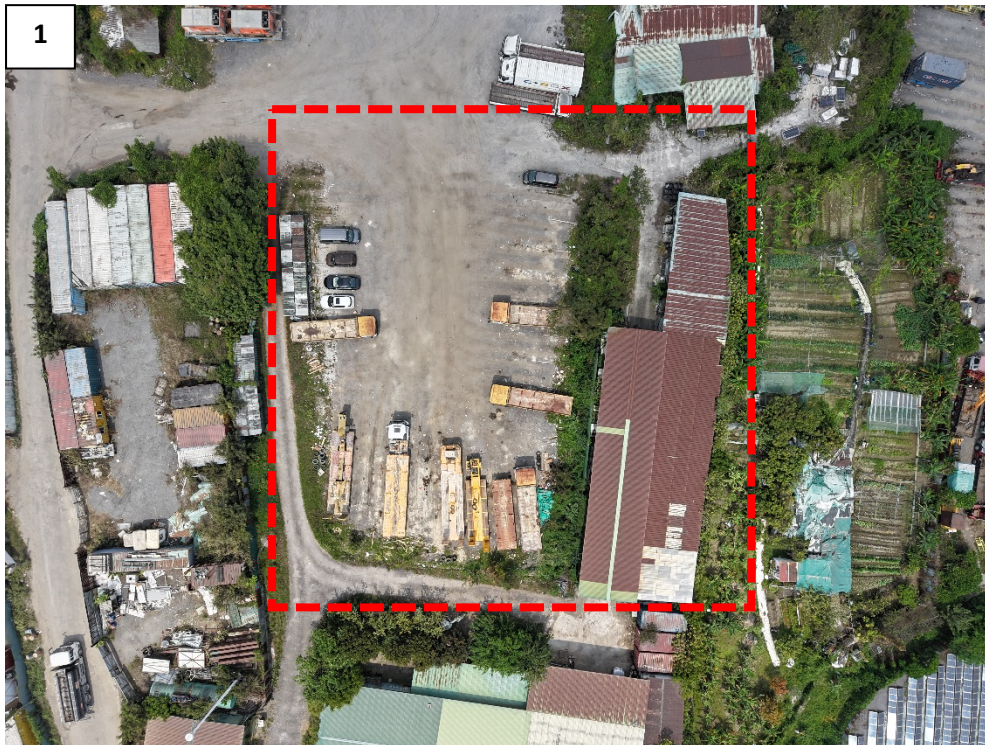
Source: Aerial Photos taken on 19.03.2026