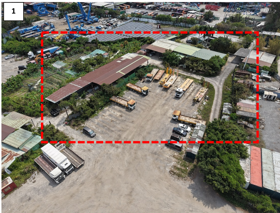
Source: Aerial Photos taken on 19.03.2026